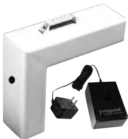
IN GROUND POOL ALARM WITH REMOTE RECEIVER