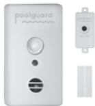
DOOR ALARM WITH TRANSMITTER