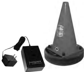
"SAFETY BUOY" ABOVE GROUND POOL ALARM WITH REMOTE RECEIVER